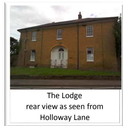
The Lodge rear view as seen from Holloway Lane

Director of Education and Research Islamic Shakhsiyah Foundation